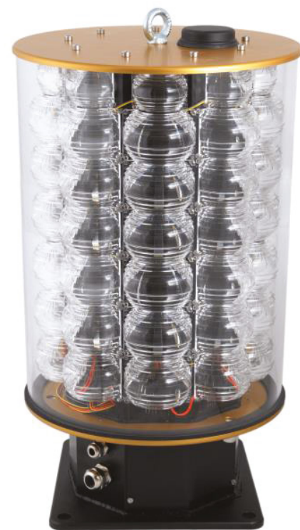
High-Intensity 100 000cd Stand-Alone LED Aviation Obstruction Lights