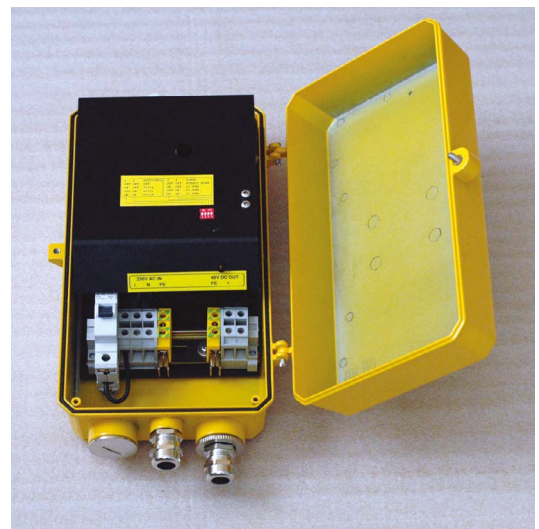
CEL-PS-115-48-1A8 Power Supply Unit