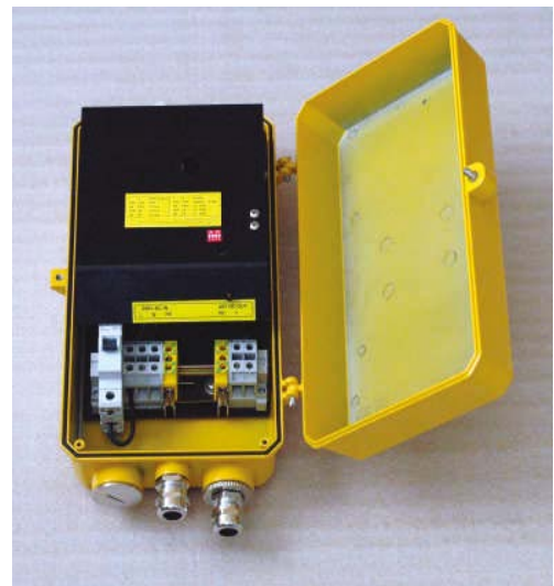
CEL-PS-230-24-3A5 Power Supply Unit