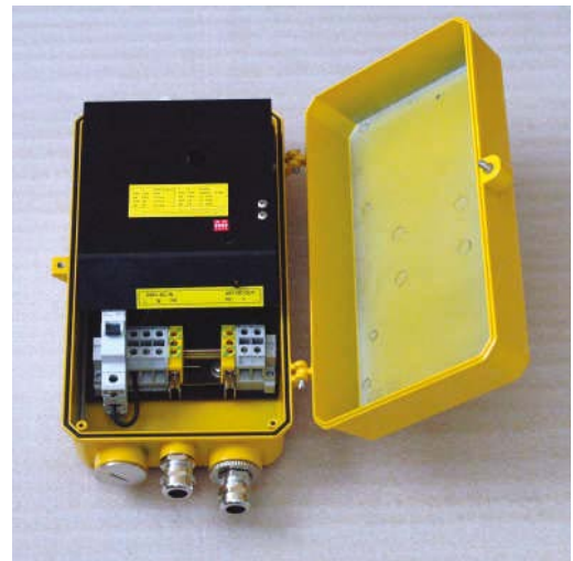
CEL-PS-230-24-09 Power Supply Unit