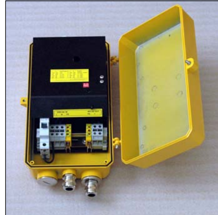
CEL-PS-24-09 Power Supply