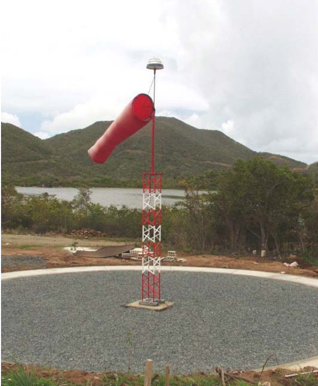
Externally illuminated wind cone

The wind cone can be full size Ø90 x 360 cm or heliport size Ø63 x 250 cm. Colours red/white or solid red.