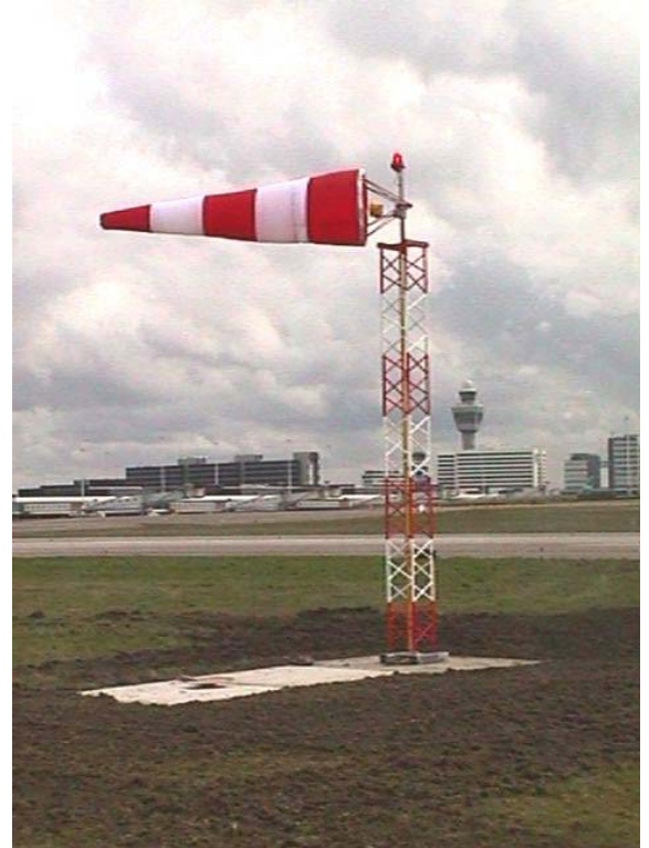
Internally illuminated wind cone

Contarnex Europe Limited. 252 Martin Way, Morden, Surrey, SM4 4AW. England