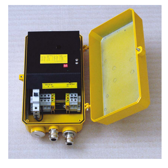
CEL-PS-115-48-1A8 Power Supply Unit